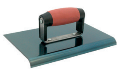
BLUE STEEL EDGER