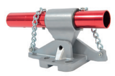
LIGHTWEIGHT & ECONOMICAL PERFECT FOR FRESNO OR BULLFLOAT